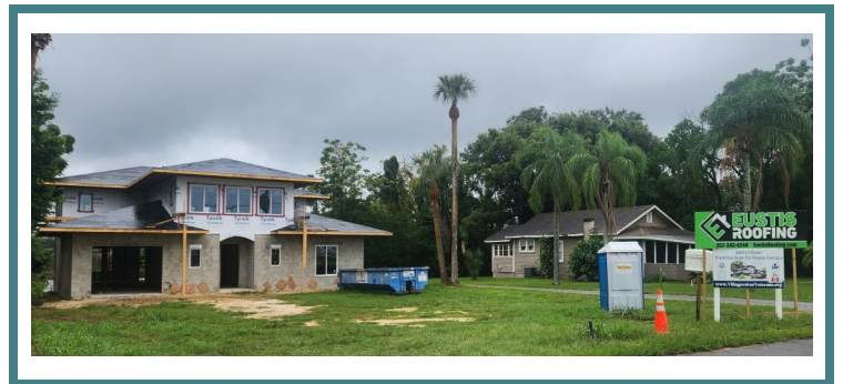
Eustis Roofing is under contract to complete the roof.