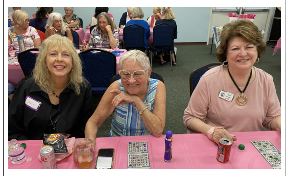
“Flaming Bingo” . A Fundraiser benefiting LovExtension. This was a GFWC National Day of Service project.