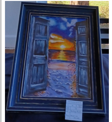
Uta Pergler - Painting on Canvas Painting - Acrylic