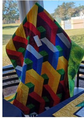
Cristie Kern - Gears Quilt Quilting