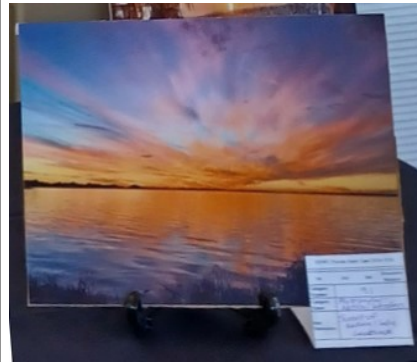
Karin Pierson - Sunset of Natural Landscape Photography Natural Wonders