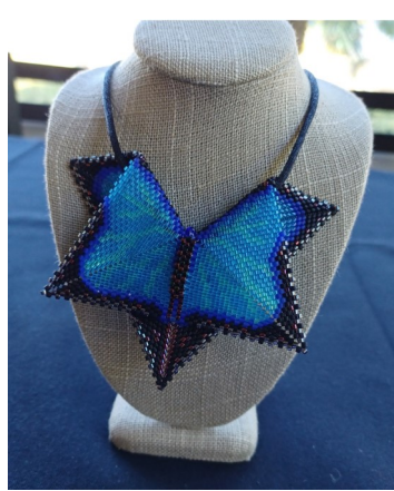
Dee Olive - Blue Morpho Necklace - Jewelry Bead weaving w/ needle