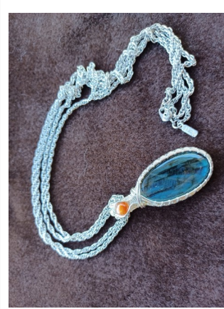
Dee Olive - Wire Weave Pendant - Jewelry Metal