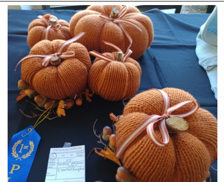
Maureen Melvold - 5 Pumpkins Knitting