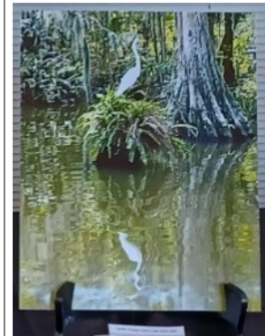
Delores Deen Great White Heron Photography Reflections