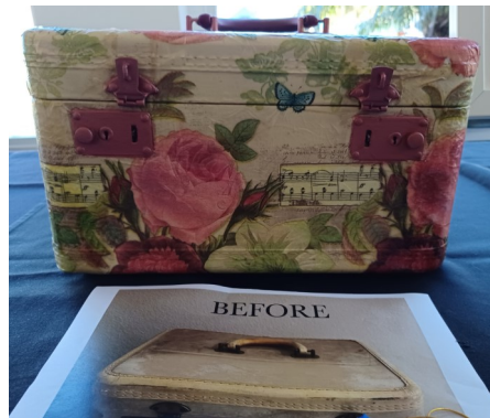
Kim Barnes - Train Case Decoupage