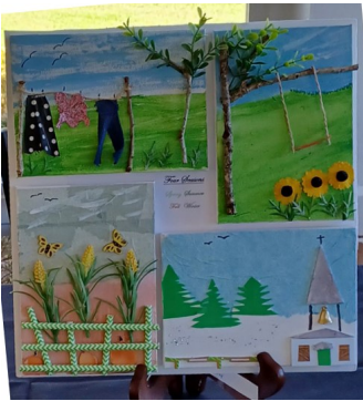
Donna Kelly - Four Seasons Mixed Media/Collage