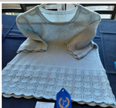
Maureen Melvold - Sweater Pullover Knitting Clothes