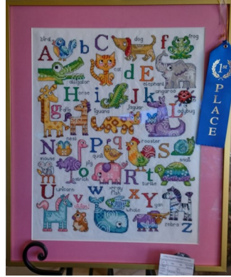
Lynn Kirman - Child's Alphabet Sampler Cross Stitch