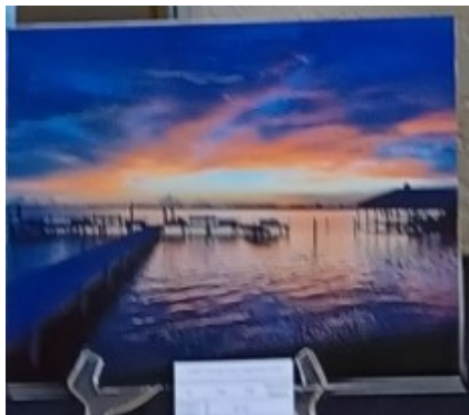
Flo Fenneman - Landscape Photography - Florida unique to State