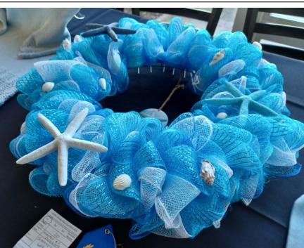
Diane Cole - Summer Wreath with Shells - Wreaths all Occasions