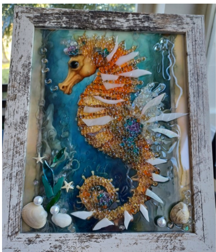
Gail Mahan - Seahorse Mosaic Hand built