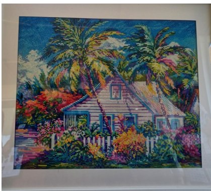
Gail Mahan - Beach Cottage Painting - Wood, Clay, Glass, etc.